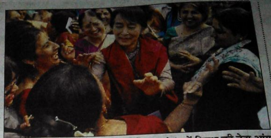
हाल ही में अपने भारत दौरे के दौरान म्यांमार में विपक्ष की नेता आंग सान सूकी अपने कॉलेज लेडी श्रीराम कॉलेज पहुंची थीं

हॉस्टल फैसिलिटी है। अगर कॉलेज में हॉस्टल नहीं मिल पाता तो भी कैम्पस के आसपास किराये पर मकान मिल जाता है। आउट ऑफ कैम्पस कॉलेजों में विदेशी स्टूडेंट्स की संख्या बहुत कम होती है। कैम्पस कॉलेजों में भी बीकॉम ऑनर्स व बीकॉम कोर्स की सीटें ही फुल होती हैं, बाकी कोर्सेज में कम एडमिशन होते हैं।